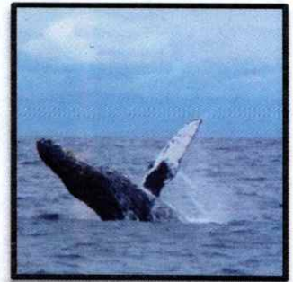
Marine life at risk!

Offshore wind energy is renewable but will impact the ocean and marine life. The scope and magnitude of the industrialization of nearly one million acres for wind energy are unprecedented for the marine ecosystem just off the New York/New Jersey Coast; the current development is nearly the size as Grand Canyon National Park, with more to come. There will also be cumulative impacts – currently unknown by science – from offshore wind facilities proposed from Massachusetts to North Carolina. There are few laws protecting marine life. The large-scale sale and development of the NY & NJ lease areas is too much, too fast . The risks are high for the ocean and marine life. There are cheaper, faster, and safer energy-wise solutions that can be implemented now on land, while pilot studies determine how to conduct offshore wind in an environmentally responsible manner.